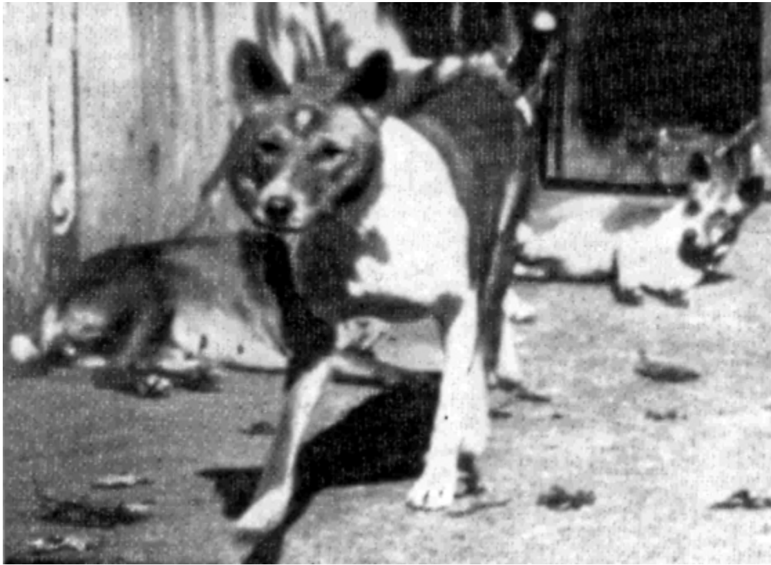
Kongo-Hunde, Berlin Zoo 1905