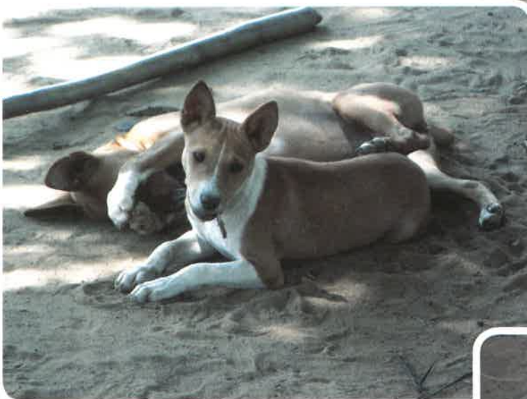
Left: Two red and white dogs playing