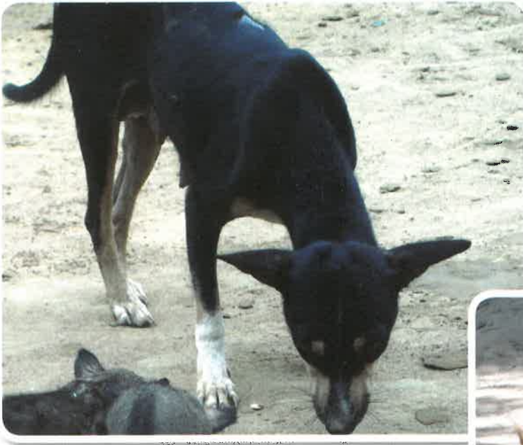
Left: Tri-colored bitch; she is very thin due to nursing puppies