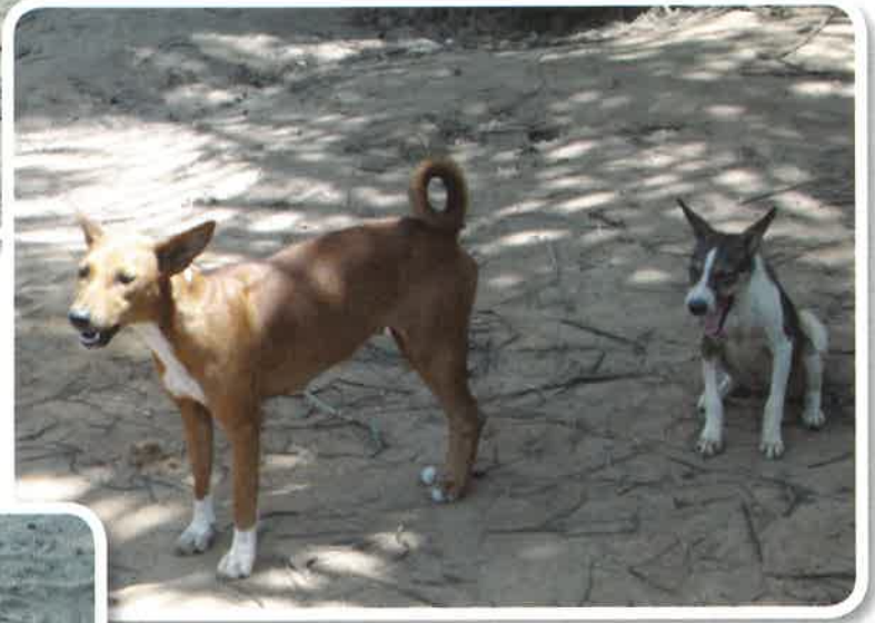
Right: Red and white with loose tail curl. Puppy on right may be a mahogany tri