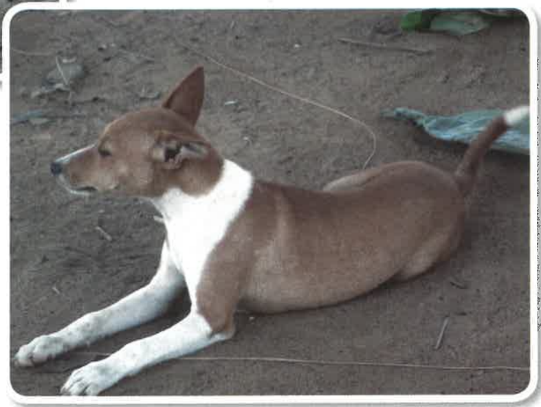
Right: Red and white